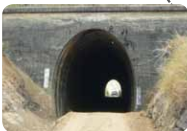
Heritage listed Yimbun Tunnel