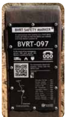
Yimbun Tunnel marker