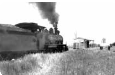
Photo of Yimbun Station taken in 1964