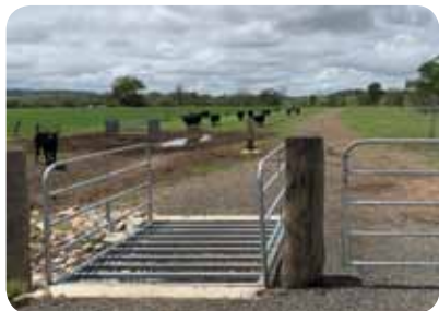
Newly installed grid for cyclists

In the early days of the rail trail everyone had to negotiate numerous closed gates. Recently grids have been installed along most of the trail allowing cyclists to continue rolling instead of stopping. Be aware that the grid is not designed for pedestrians due to the wide gaps.