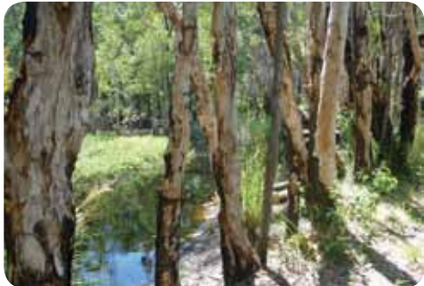
Swamp Melaleuca beside the lagoon