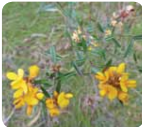
Heathy Parrot Pea