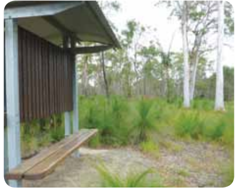
Bench with view of Leslie Harrison Dam