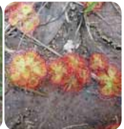
Insectivorous Spoon-leaf Sundew