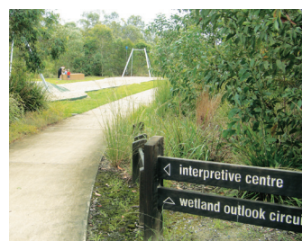
Billabong Outlook path