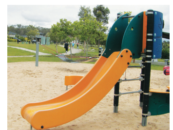
Billabong Outlook playground

One of 272 detailed maps of beautiful bike rides from Family Rides in South East Queensland available at your local bike shop or www.familyrides.com.au