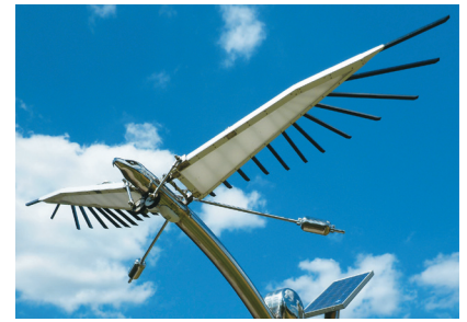
Bird sculpture as part of the Interpretive Centre

Scale 1:10,000 (1cm = 100m) m 100 200 300 400 500