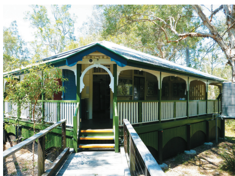
Boondall Wetlands Environment Centre

Scale 1:20,000 (1cm = 200m) m 100 200 300 400 500