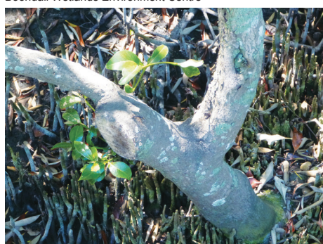
Grey Mangrove with peg roots