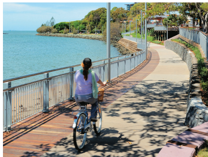
Redcliffe Beach

The population of Redcliffe swelled every weekend and holiday from the earliest years of settlement. Brisbane residents seeking sandy beaches caught the regular steamboat and ferry service to Redcliffe Jetty, built in 1883.