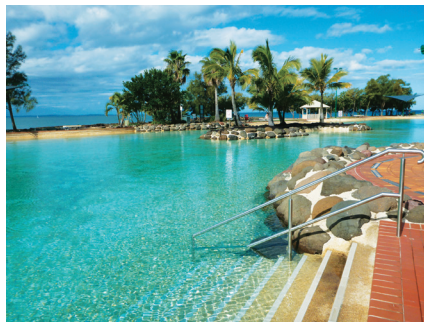
Settlement Cove Lagoon