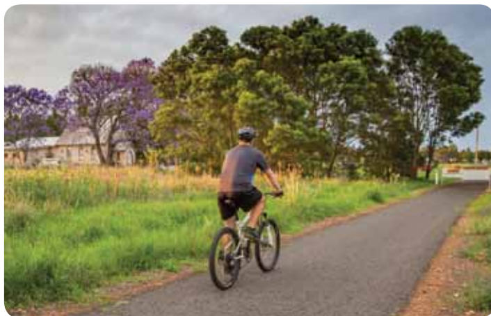
Riding into Memerambi