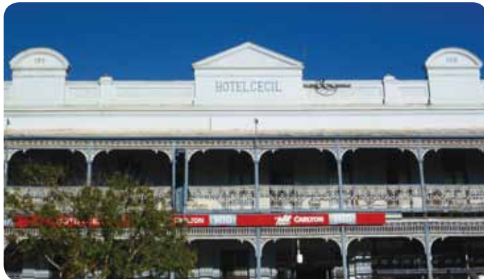
The Hotel Cecil has been operating in Wondai since 1911.

In Wondai there are two to choose from. On the lower side of the tracks is the Wondai Hotel opened in 1905 and on the high side is the Hotel Cecil. Both offer lunch, dinner and accommodation as well as live entertainment.