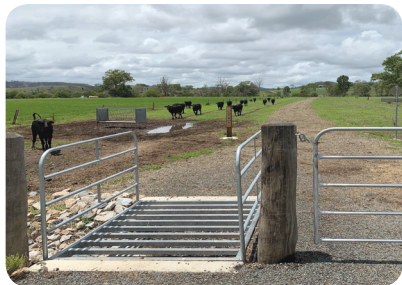
Newly installed grid for cyclists

In the early days of the rail trail everyone had to negotiate numerous closed gates. Recently grids have been installed along most of the trail allowing cyclists to continue rolling instead of stopping. Be aware that the grid is not designed for pedestrians due to the wide gaps.