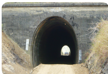
Heritage listed Yimbun Tunnel