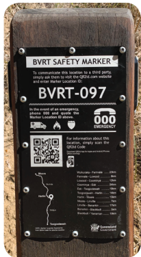
Yimbun Tunnel marker