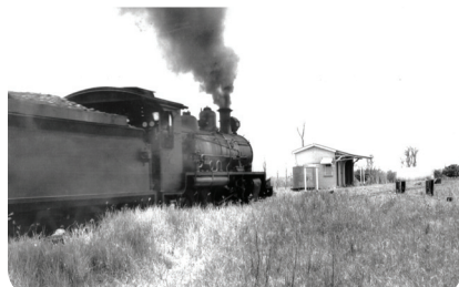
Photo of Yimbun Station taken in 1964