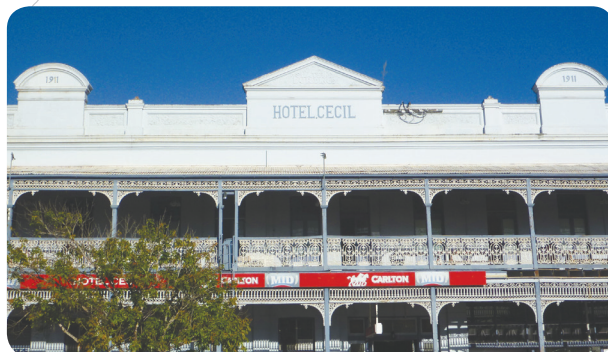
The Hotel Cecil has been operating in Wondai since 1911.

On the lower side of the tracks is the Wondai Hotel opened in 1905 and on the high side is the Hotel Cecil. Both offer lunch, dinner and accommodation as well as live entertainment.