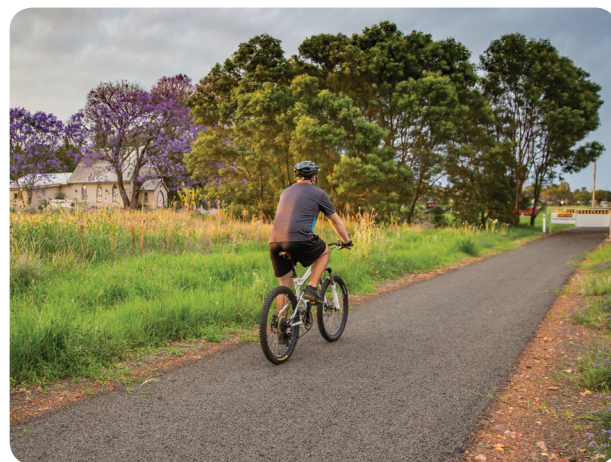
Riding into Memerambi